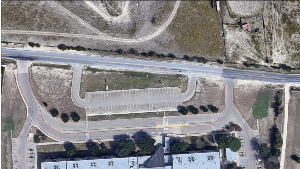
Aerial view of the front of Nolanville Elementary School